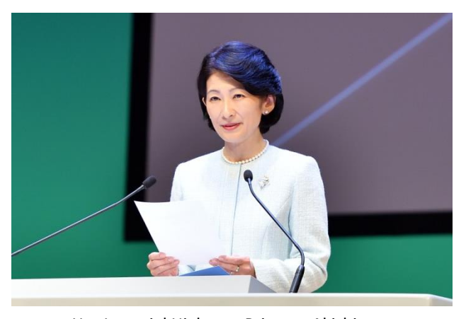
Her Imperial Highness Princess Akishino