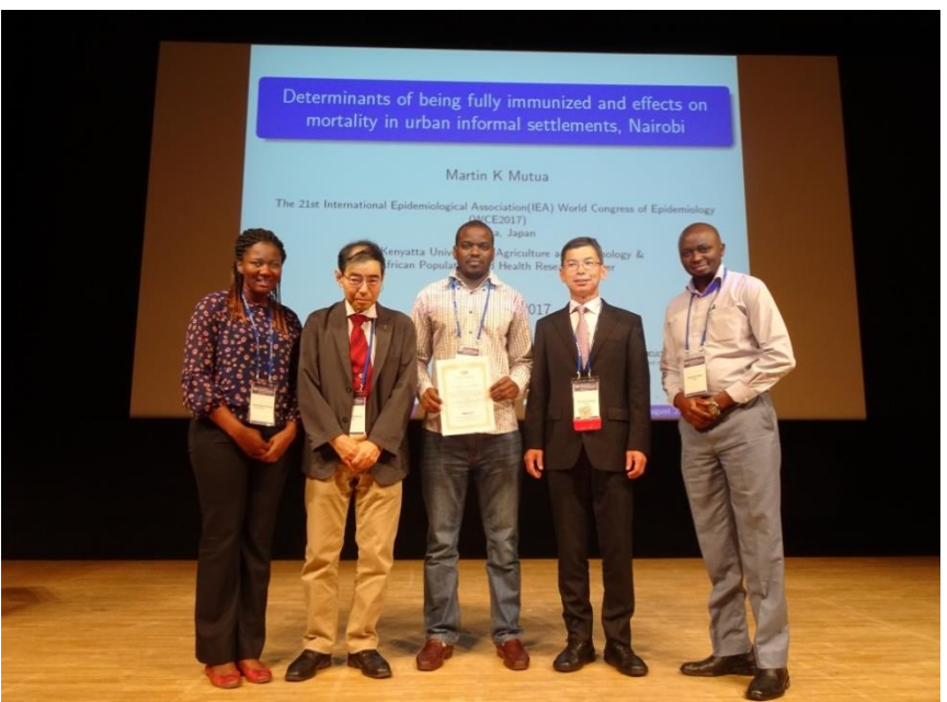
Travel Awards were given to the selected abstracts applied for the award.