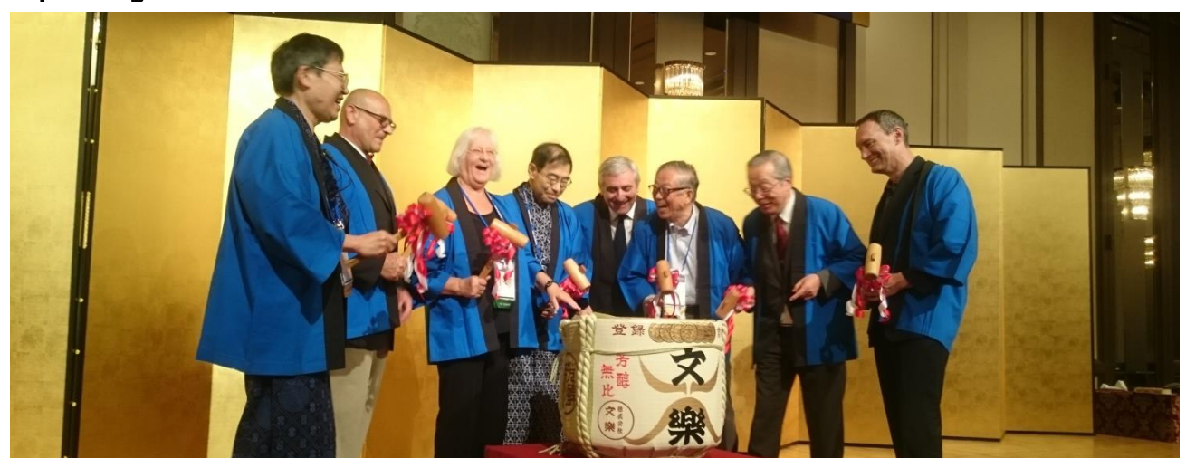
"Kagami-biraki," a ceremony of celebration in which the lid of a Sake barrel is broken by wodden hammers.