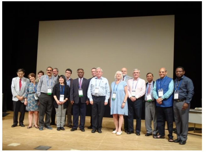
IEA Presidency was handed over. Outgoing and Incoming Presidents and Treasurer made a report respectively. Farewell to Outgoing Council members and welcomed Incoming Council members. Plans for WCE2020 and bids for WCE2023 were announced.