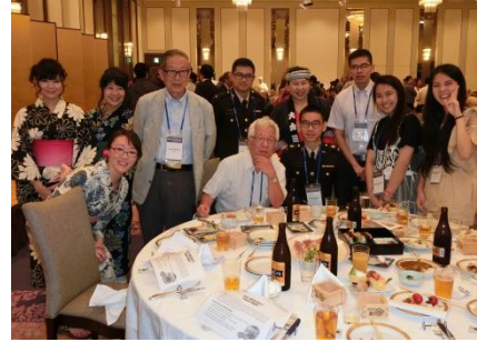
Participants from overseas also enjoyed the Bon festival dance in Yukata (Kimono for summer).