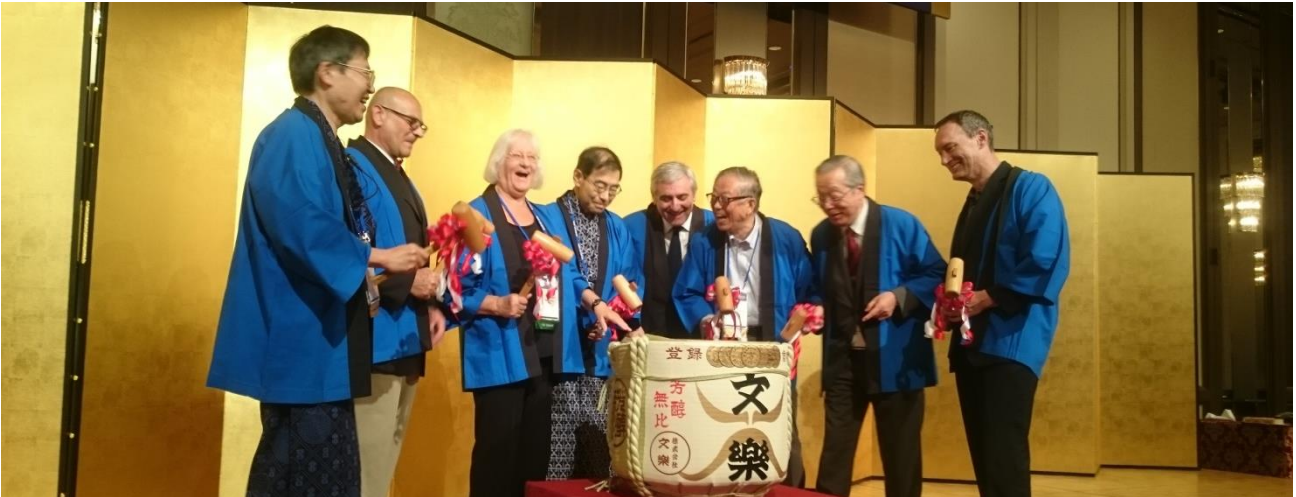
“Kagami-biraki,” a ceremony of celebration in which the lid of a Sake barrel is broken by wooden hammers.