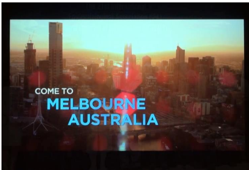
A bridge to Melbourne, Australia, the place to host the next WCE in 2020.