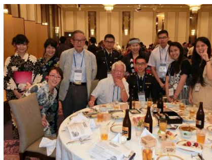
Participants from overseas also enjoyed the Bon festival dance in Yukata (Kimono for summer).