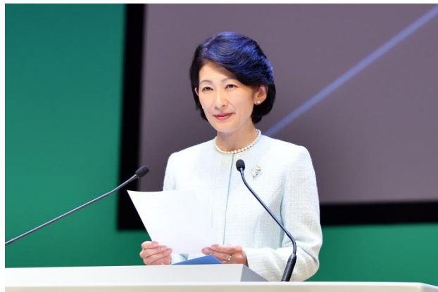
Her Imperial Highness Princess Akishino